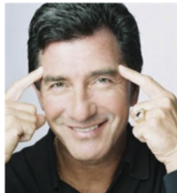
T. Harv Eker

Rental real estate, royalties from books / music / software, owning vending machines and Network Marketing!